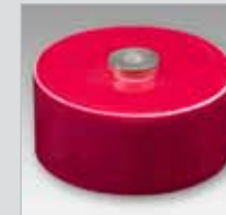
HV Caps "Hockey Pucks"