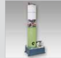
SPST HV AC/DC Contactors