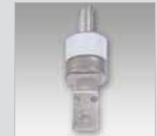
Industrial Interrupters - different mounting configurations