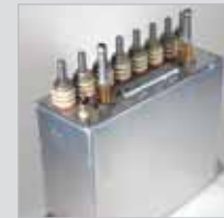
Power Distribution Capacitors