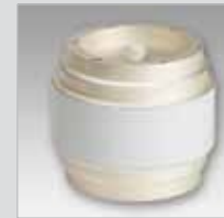
Fixed Vacuum Capacitors