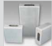
High Voltage Capacitors