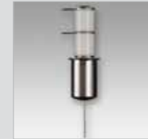
SPST Vacuum-Filled Relays