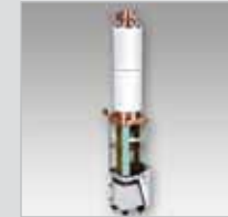
SPDT High Voltage Contactors