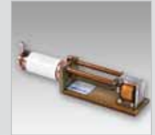
SPST High Voltage Contactors