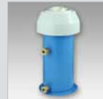
Water Cooled Pot Capacitors