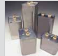
Energy Storage Capacitors