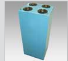
Energy Storage Capacitors