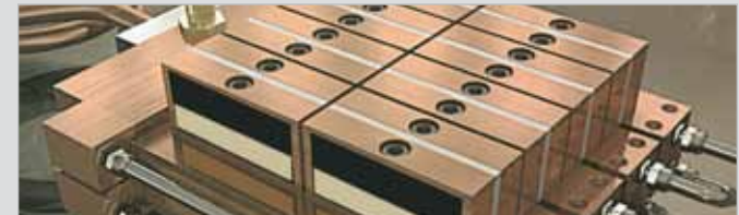
Water Cooled Assemblies