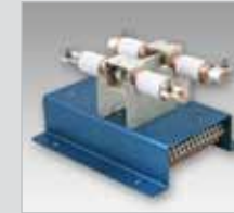
RF High Voltage Contactors