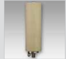
Gas- Filled Relays