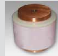
Power Distribution Modular Capacitors