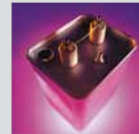
High Voltage Pulse Capacitors