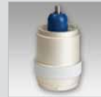
Variable Vacuum Capacitors