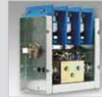
Three Phase Contactors