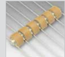
Cascade Capacitor Stacks