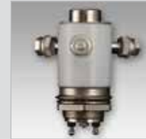
SPDT Vacuum-Filled Relays