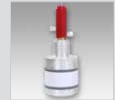
Water Cooled (Variable) Vacuum Capacitors